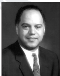
Sen. Gary George