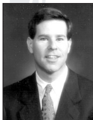
Sen. Brian Burke