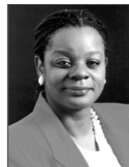
Sen. Gwen Moore